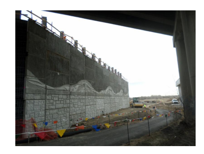
Construction occurring below I-25 for the new bridge over Thomas Phelps Creek.

The next time you drive on I-25 over Thomas Phelps Crrek, definitely pay attention to the cone zones and the work taking place that you're able to see, but also imagine all the work happening underneath!