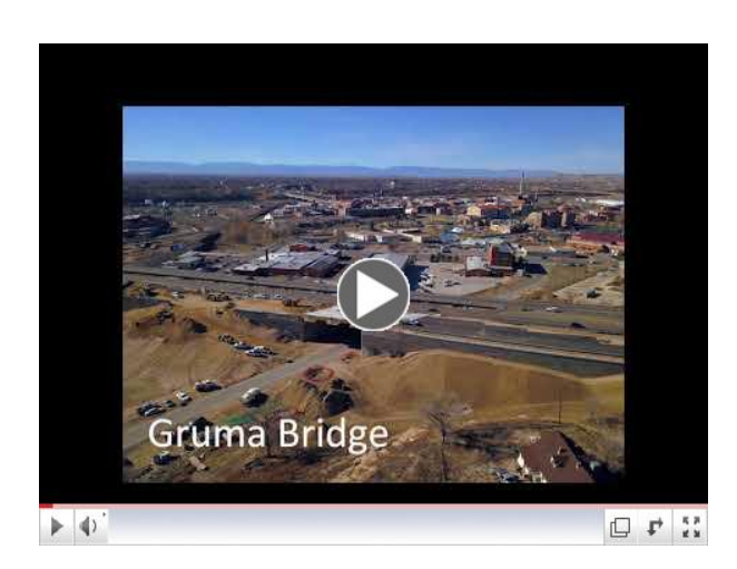
Take a tour of the Ilex Project from the sky!