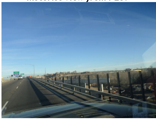
The view motorists have traveling on I-25 over Thomas Phelps Creek.